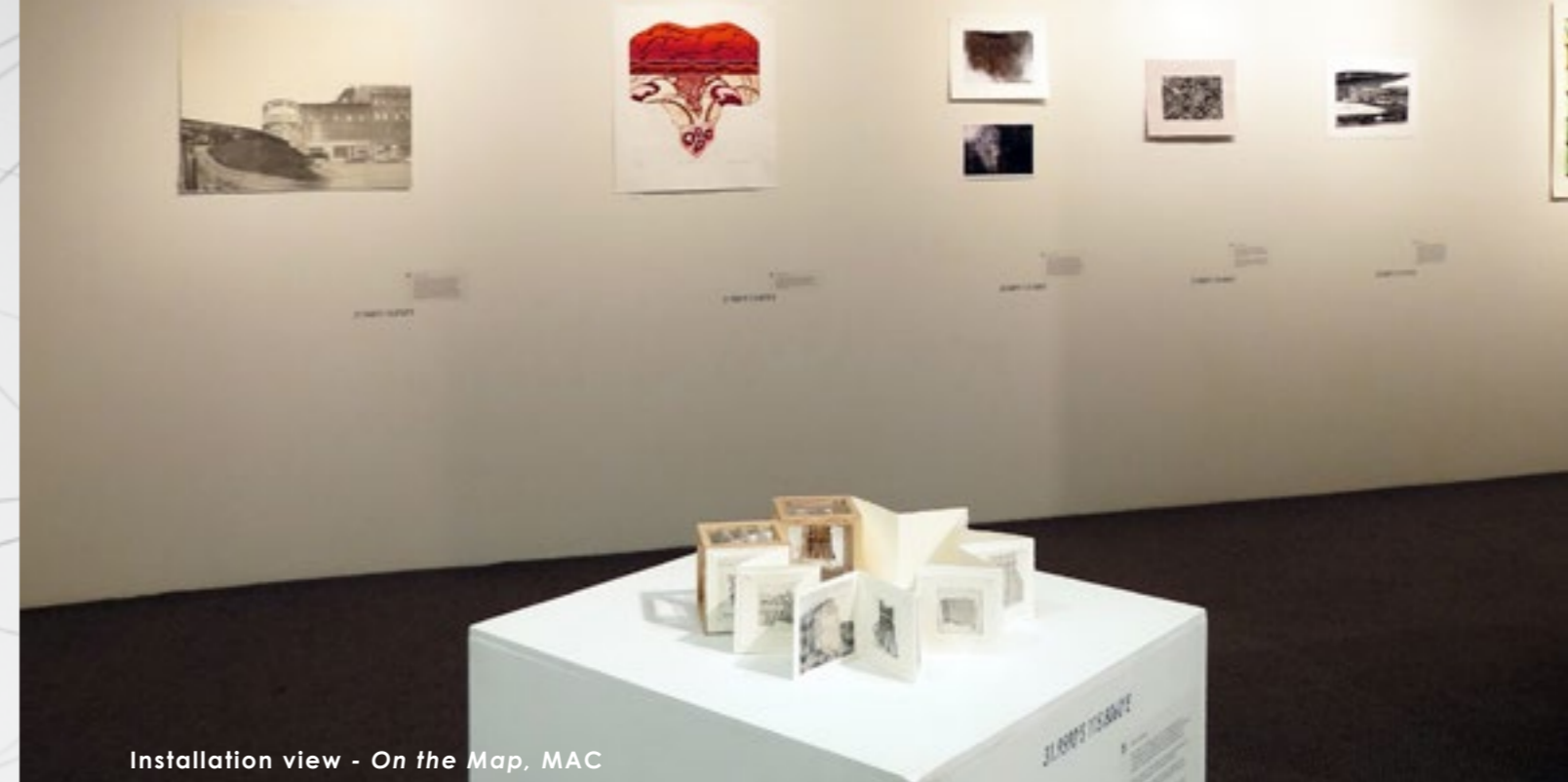
Installation view - On the Map , MAC

Alastair Taylor, One Hundred and Three of Me , 2017, acrylic, Aluminium, wire, MAC