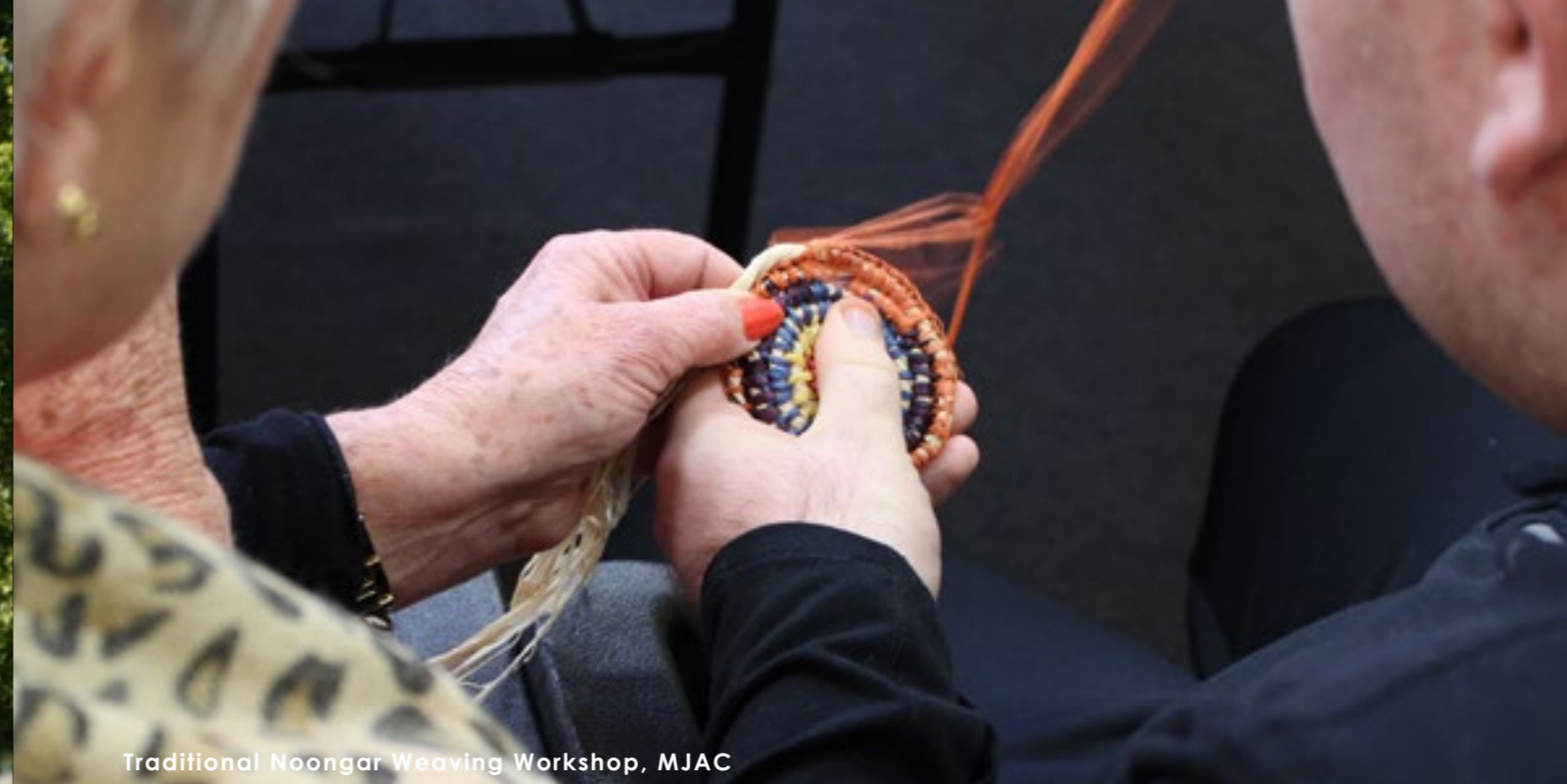
Traditional Noongar Weaving Workshop, MJAC

created costumes based on the concept of Steampunk.