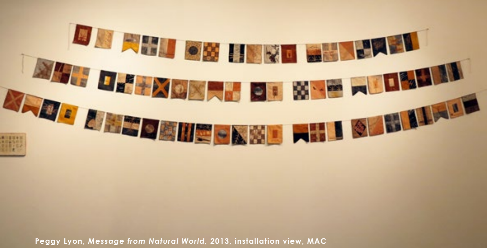
Peggy Lyon, Message from Natural World , 2013, installation view, MAC