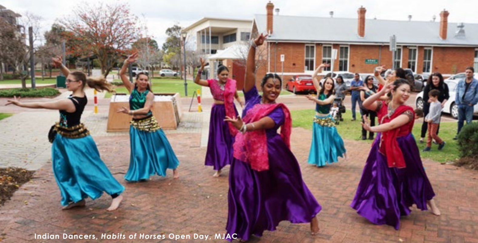
Indian Dancers, Habits of Horses Open Day, MJAC