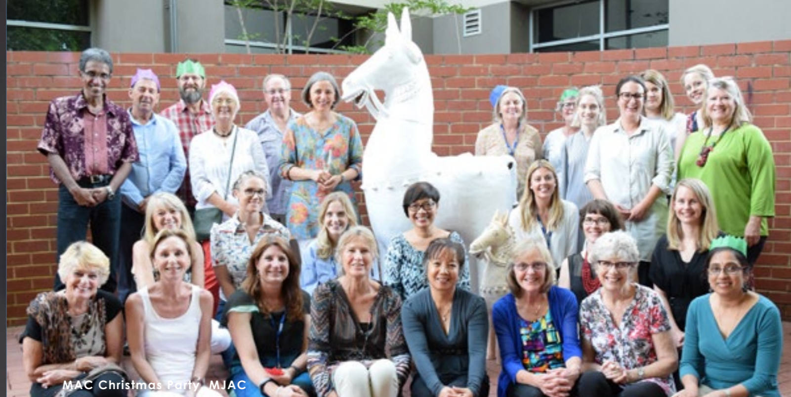
MAC Christmas Party - MJAC