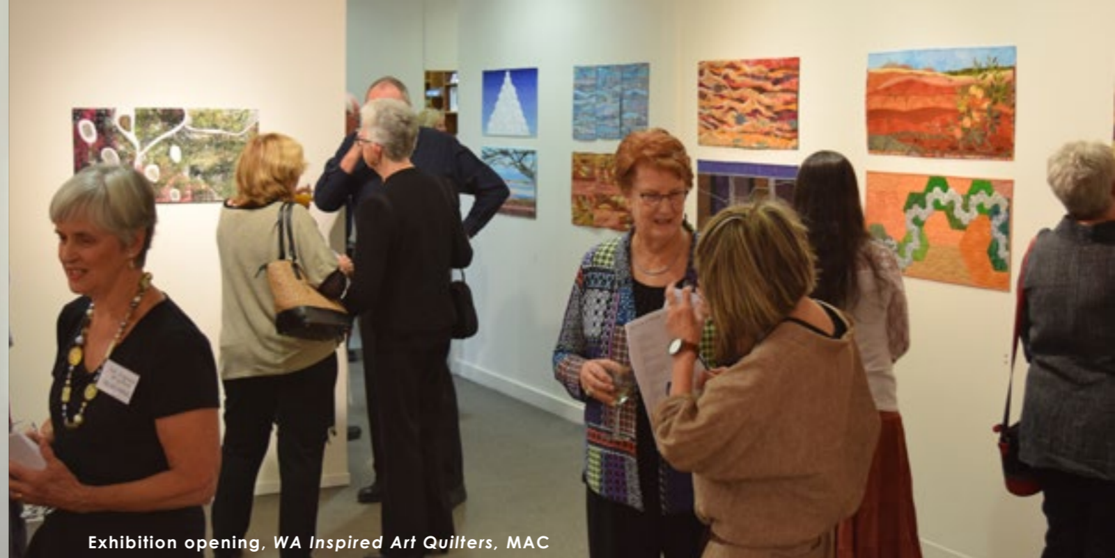
Exhibition opening, WA Inspired Art Quilters , MAC