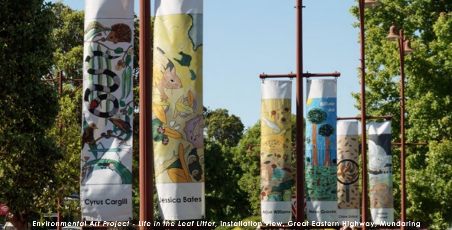
Environmental Art Project - Life in the Leaf Litter, installation view, Great Eastern Highway, Mundaring