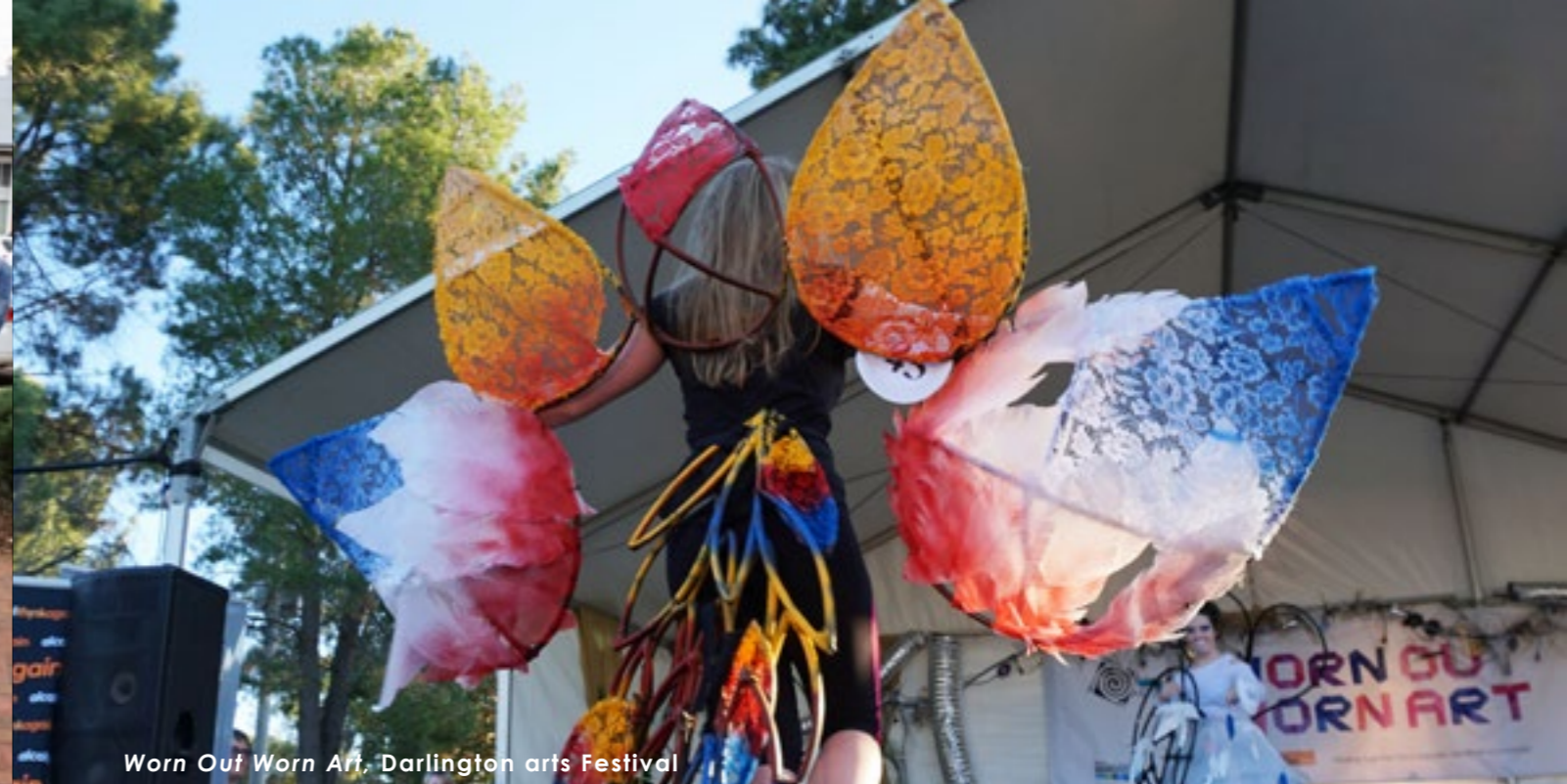
Worn Out Worn Art, Darlington arts Festival