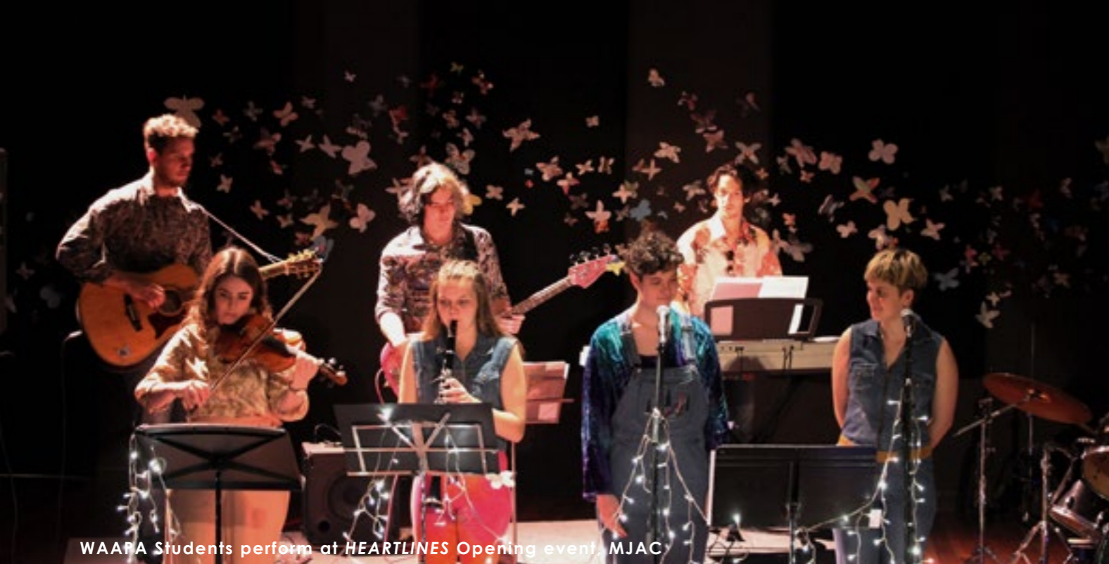
WAAPA Students perform at HEARTLINES Opening event, MJAC