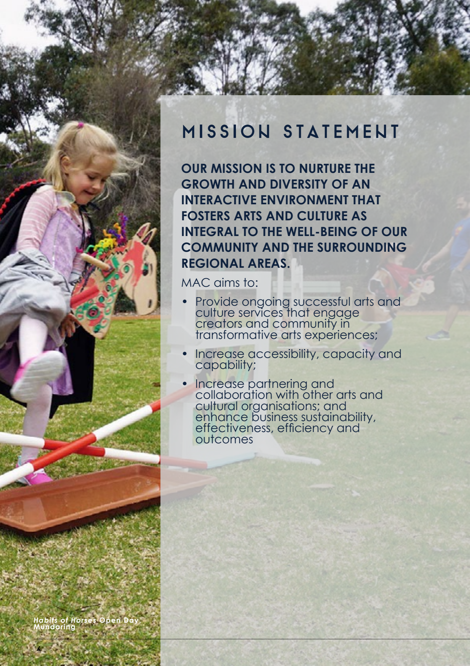
Habits of Horses Open Day, Mundaring