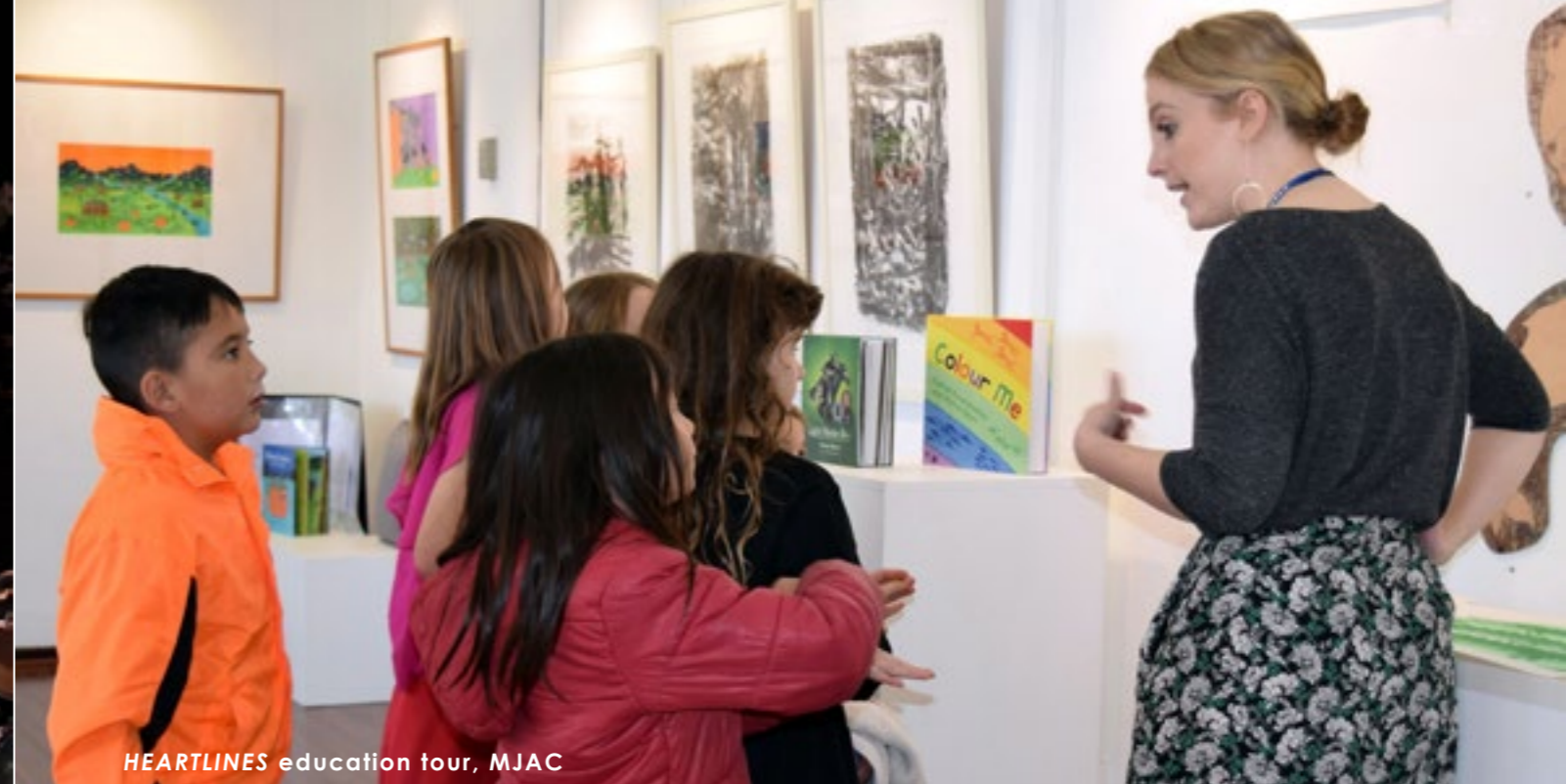
HEARTLINES education tour, MJAC