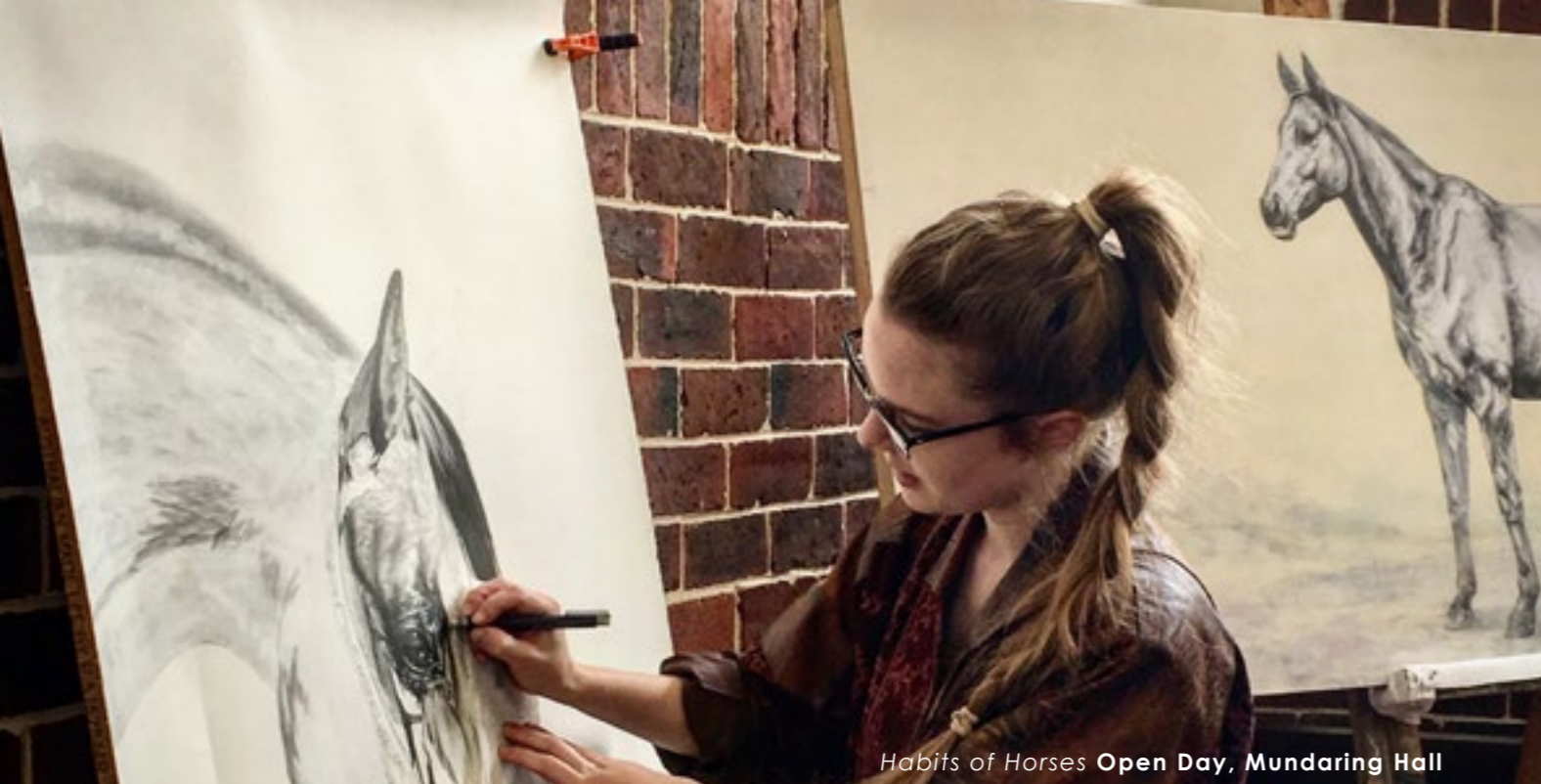
Habits of Horses Open Day, Mundaring Hall