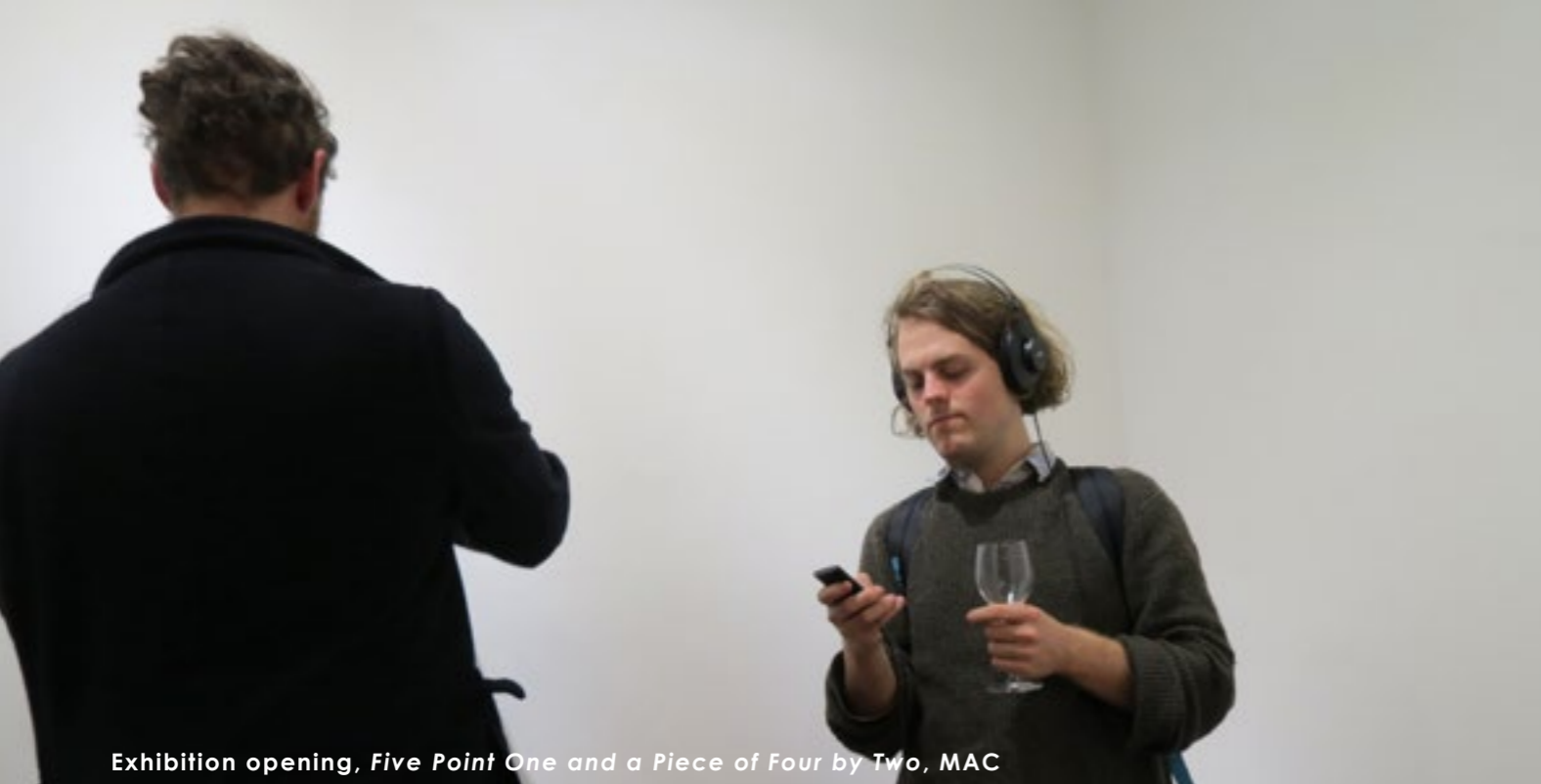
Exhibition opening, Five Point One and a Piece of Four by Two , MAC